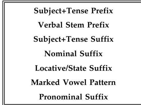
Diagram 2.3.1: Types of Morphemes in WIT-BHS

The order in which the elements are listed here is the order in which they may occur in a word in WIT-BHS. Throughout these pages, we will use the term morpheme in a special sense, namely as referring to one of the above morphological elements as represented in WIT-BHS, and capable of being interpreted by the computer.